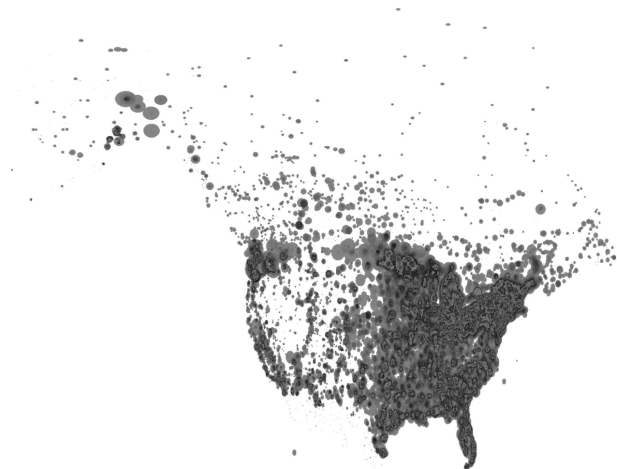
Figure 1: The map of 45570 North American FM transmitters (2005).

The maximal intensity of the reflected signal is obtained in the case of a coherent scattering: the transmitter, the trail and the receiver are aligned in such a way that the transmitter and the receiver are foci of an ellipsoid, while the meteor trail is tangent to this ellipsoid. In most cases the trail can be approximated as a straight line, but for meteors with a long duration ( \sim 10 s) the trail becomes deformed due to wind. Ionization useful for meteor forward-scattering occurs between 80 and 120km above the earth's surface, hence the maximum distance where reflected signal can be received is 2400km. In the case of the radar observations, the ellipsoid becomes a sphere which makes data analysis much simpler than in the case of forward-scattering.